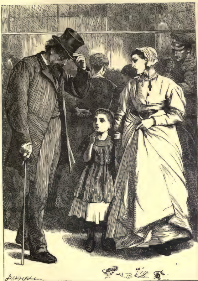
Leaving the Morgue.